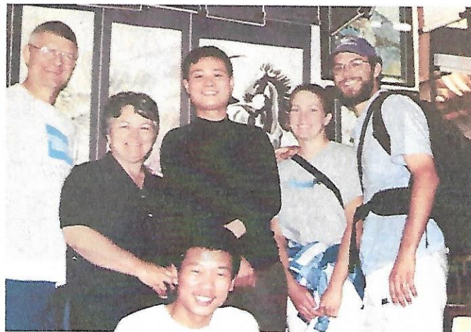
May 2002, our first trip to Xian, China

35 By this shall all men know that ye are my disciples, if ye have love one to another.