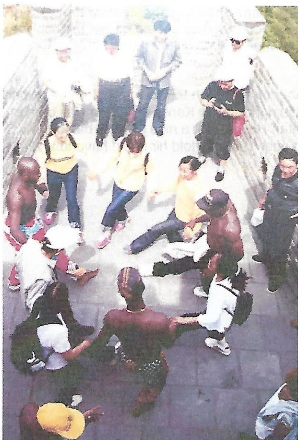
May 2002, Outside Beijing, China

Chinese, Africans, Europeans and Americans didn't speak the same language but embraced the language of music, dance, happiness and fellowship.